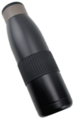
MOJO Bottle & Silicone Sleeve