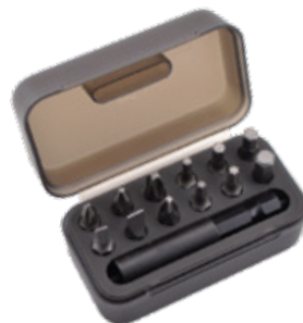
Drill bit case