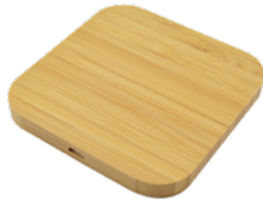
Wooden Wireless Pad