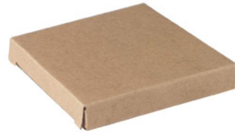
Product packaging Unbranded card box