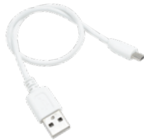
Charging cable Micro-USB cable *Cable model may vary