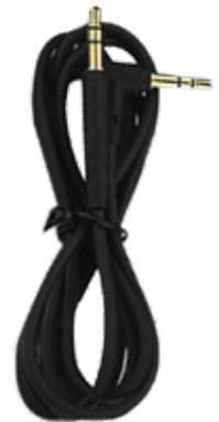
3.5mm Audio Cable