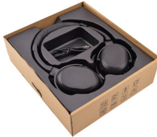
Standard Headphone Box